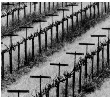
Expect some uneven bud break and some abnormal vine responses this spring

As the pruning in the district passes the halfway point, there is lots of uncertainty about everything, except quality will be the focus of growers and wineries. If you are still able to determine some dormant pruning weights for individual vines at this time, you can use those and compare them to the average crop yield per vine, calculated from the field