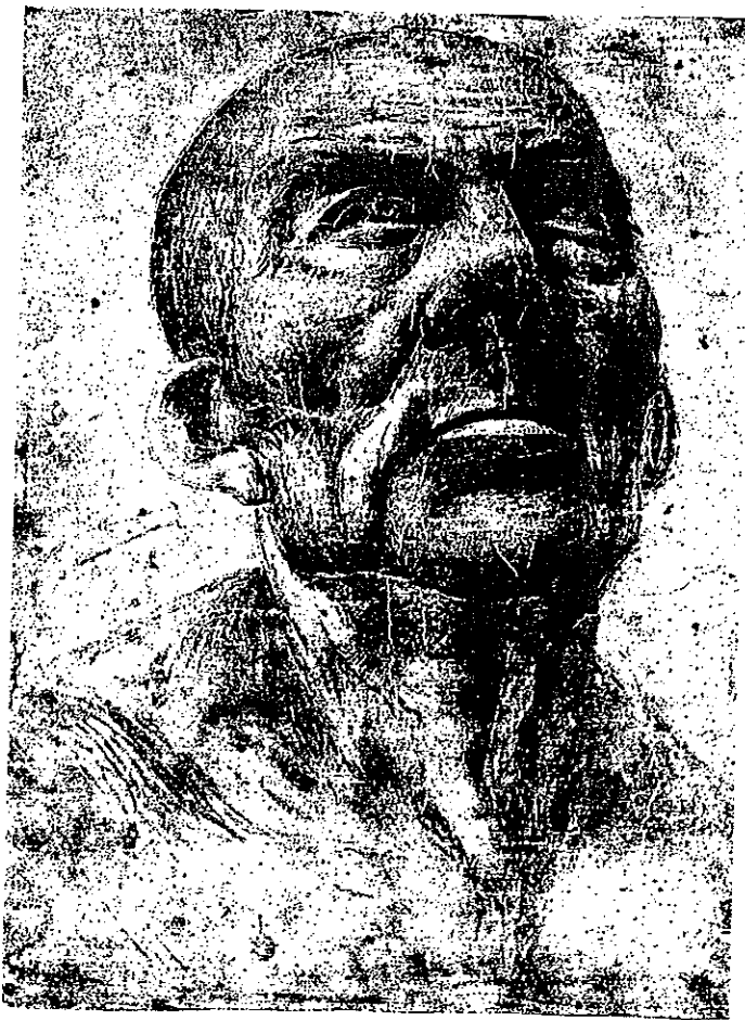
Head of an Old Man by Pellegrino Da San Daniele ca. 1500

Will it rain? If the sun comes out, will it stay too long? A vine grower can only react to nature's decisions, and hope for the best. As for the barreling of wine, we offer a bit more control. Within the tank or barrel our French Oak infusion systems allow the wine maker to choose the amount of "oakiness" in his or her particular vintage. The firing of the staves being very important, we offer them toasted at four different levels to appeal to all tastes. Our infusion tube restores old barrels in a simple and extremely clean method. The sky may have much say over the growing of grapes, but when it comes time to age them, we give vintners the final word.