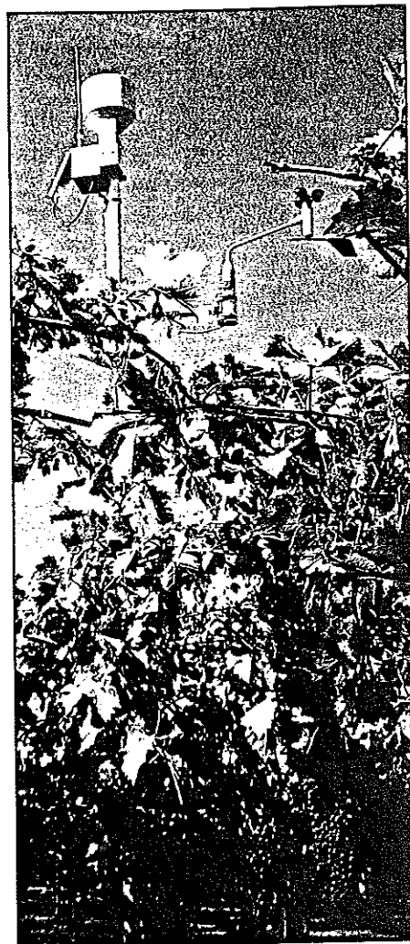
Adcon Telemetry weather station in a vineyard

The network was established in March 1995 with weather stations in 12 vineyards transmitting data to the base station. By the end of the season, weather stations in 23 vineyards had been connected. Radio transmission from each station can extend over an unobstructed distance of 10-12 miles. Data from more remote stations is relayed through closer stations in the