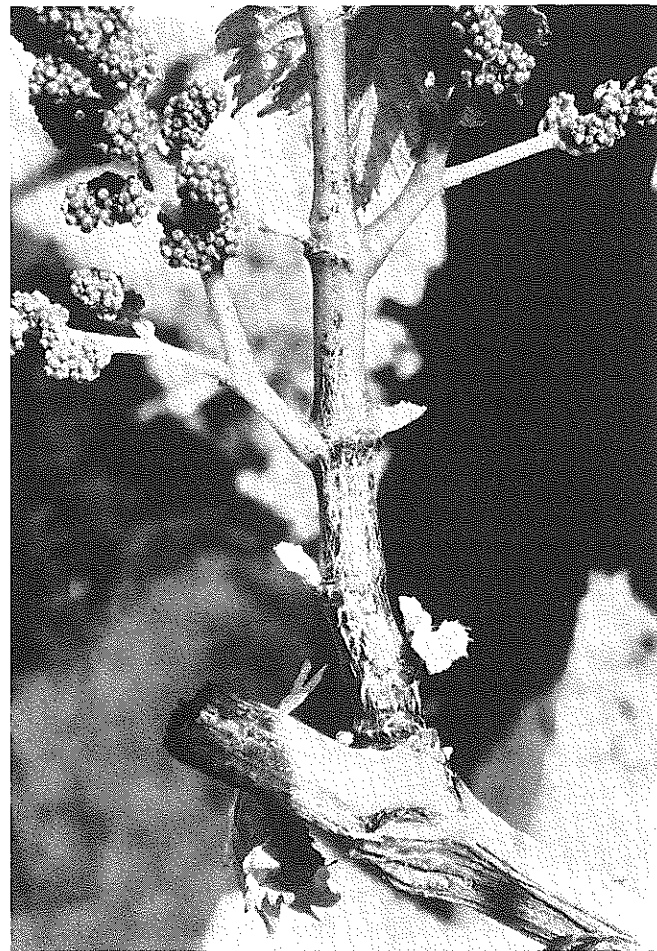
Basal portions of young shoots show numerous spots which eventually coalesce to give a scabby appearance.