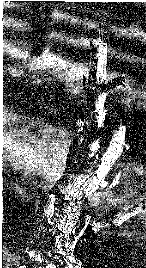
Infected canes in late winter show irregular dark-brown to black discoloration intermixed with whitish bleached areas.

Another alternative available to the grower involves treatment with a fungicide during the early growth stages. Captan, folpet, and mancozeb all give satisfactory protection of young shoots if applied before prolonged cool, wet weather. Sprays applied at budbreak to 1/2-inch (1.3 cm) shoot length and again when shoots are 5 to 6 inches (12 to 15 cm) long will provide good control. In severely affected vineyards, both dormant and early growth stage treatments may be advisable. The decision as to whether to apply a second foliar spray can be made according to the weather; for example, a heavy spring rain during early shoot growth would necessitate re-treatment for continued protection.