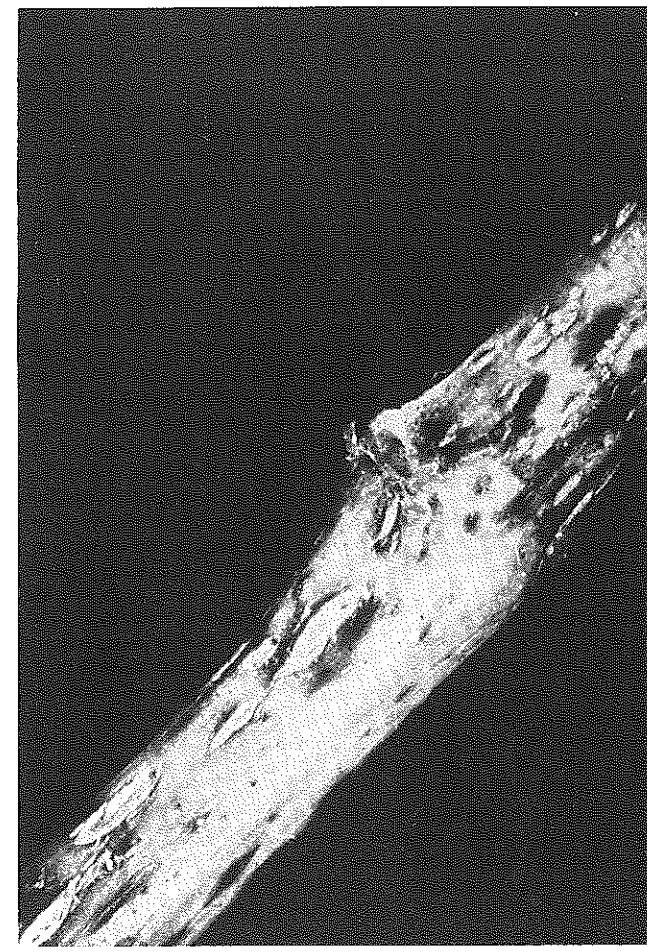
Close up of shoot spots illustrates how the epidermis cracks at the infected spots.