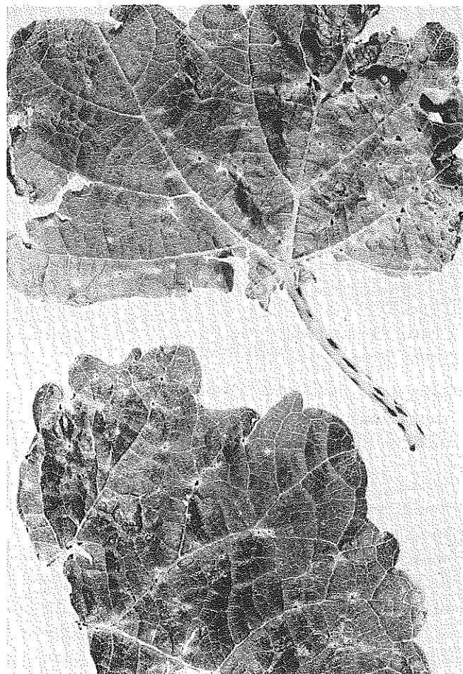
Infected leaves show tiny dark-brown to black spots with yellowish margins.