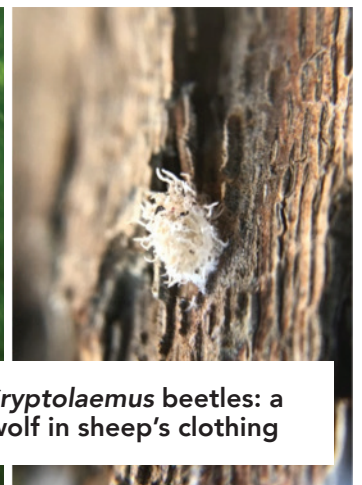
Cryptolaemus beetles: a wolf in sheep's clothing