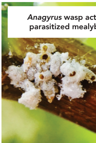
Anagyrus wasp activity: parasitized mealybugs

Cryptolaemus beetles: look for fake shaggy "mealybugs" hanging out around vine mealybug colonies.